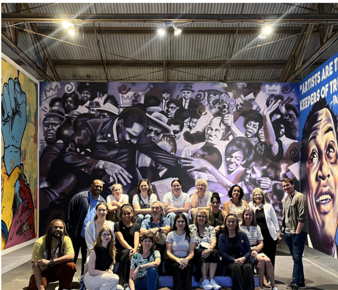
NUF Fellow at a board retreat with the Roy & Patricia Disney Foundation