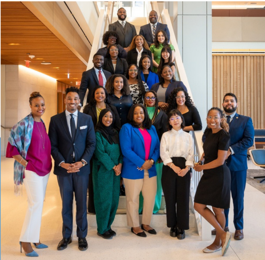
Class of 2025

The future of leadership is here, in our Fellows.